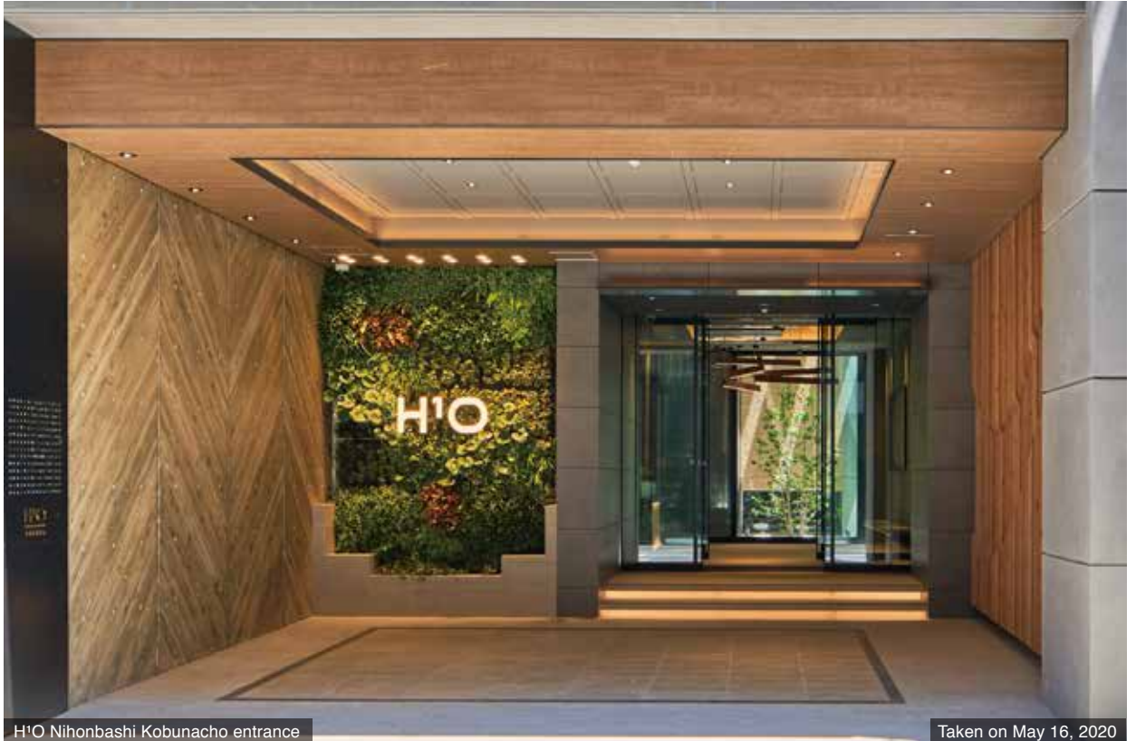
H'IO Nihonbashi Kobunacho entrance