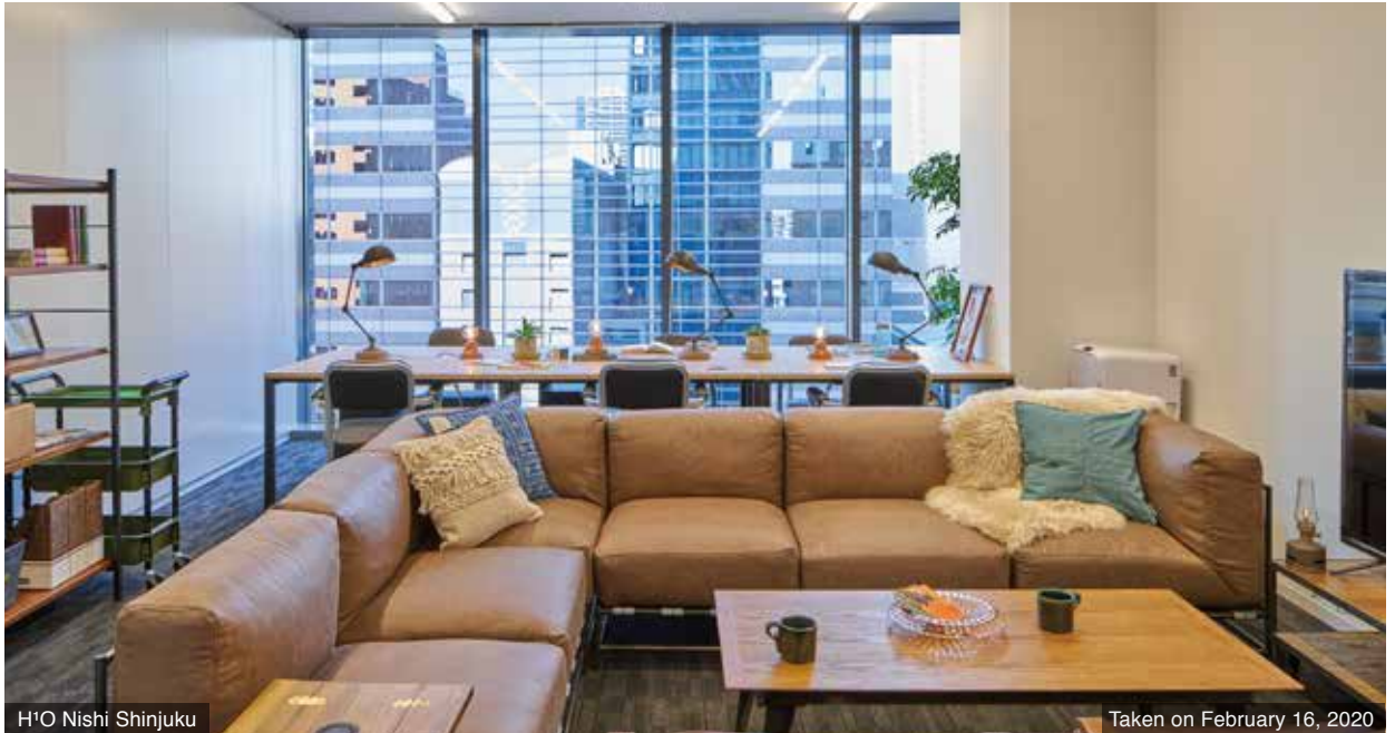
H1O Nishi Shinjuku

We protect people and information with personal spaces that ensure privacy and comfort.