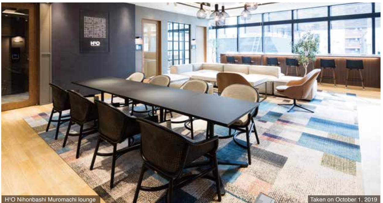
H1O Nihonbashi Muromachi lounge

The office of your choice, for the way you want to work.