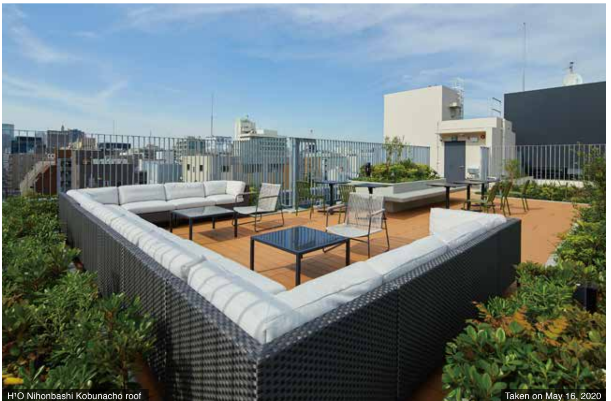
H'IO Nihonbashi Kobunacho roof